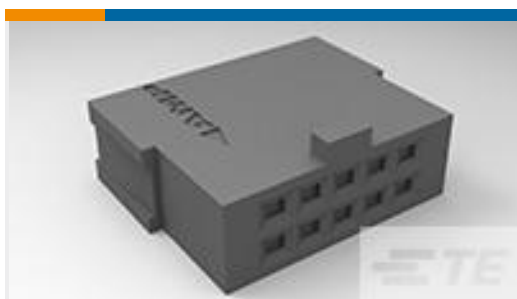
TE Part # 487223-9 034 HOUSING FFC RCPT 100CL DR